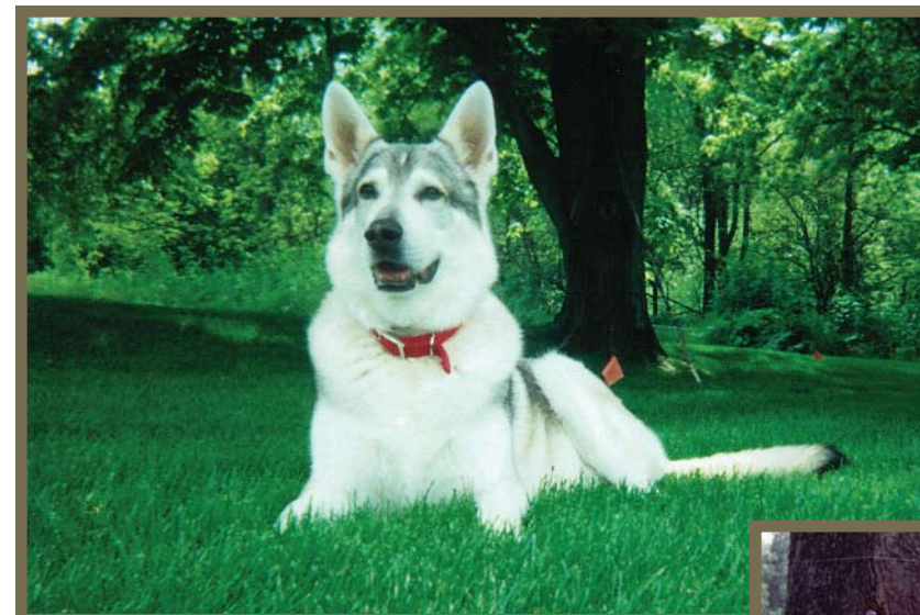
My Boy, Sequoyah